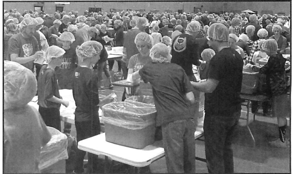
Thousands of volunteers prepare meals for hungry children at last year's Feed My Starving Children MobilePack, hosted at North Central College.

Rather than at the FMSC's Aurora site, the MobilePack location will be North Central College campus, as it was last year. As meals are packed, they will be loaded in containers to be shipped to FMSC mission partners running orphanages, schools, clinics, church and community feeding programs in any of 70 countries